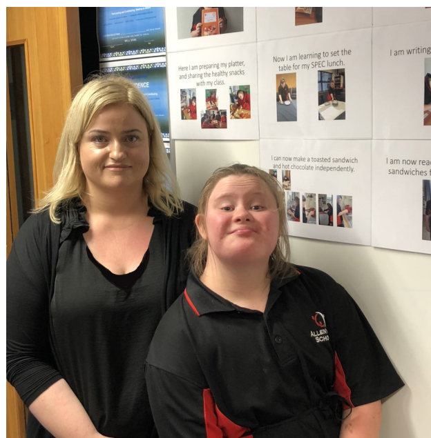
Mahi pai Eden!